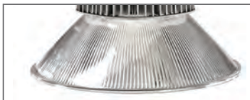
Optional Low Profile Diffuser