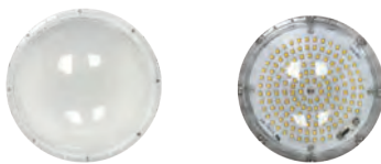
Frosted / Clear Diode Covers